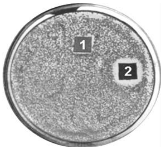
Fig. 3 – Effect of the original PS film (1) and the modified PS film (2) on Escherichia coli